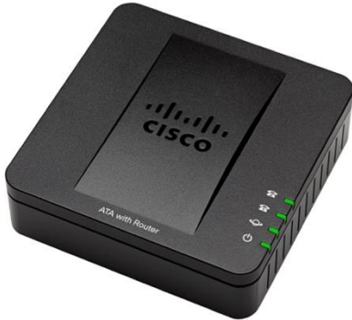
Figure 2. Ports on Cisco SPA122 ATA with Router